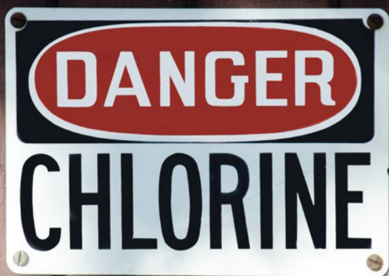
TOXIC GAS PROTECTION

Your World Leaders in the Removal of Gases, Odors, and Vapors