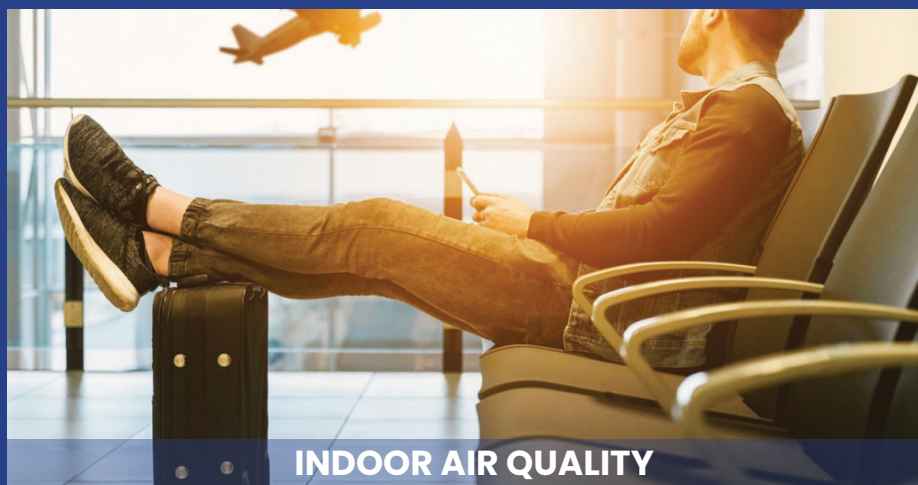
INDOOR AIR QUALITY