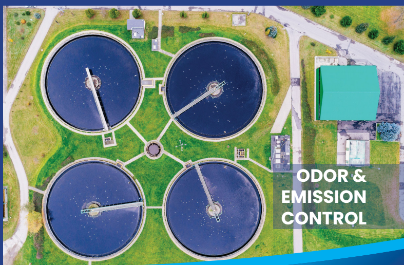
ODOR & EMISSION CONTROL